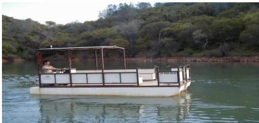
BABY 6 PEOPLE MAX

8x16 Sun shade, side & back benches, 20HP motor $80/day $500/wk