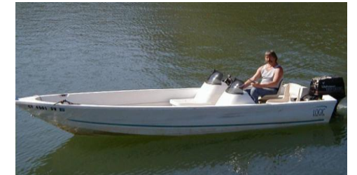
RUNABOUT 6 PEOPLE MAX $100/day

17' dual console seats, open bow, windshields, 60 HP motor