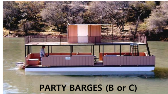
PARTY BARGES (B or C)

10X30 Lower deck: cook top, gas BBQ, ice chest, Picnic table, sink. Top deck: partial sun shade, ½ bath.