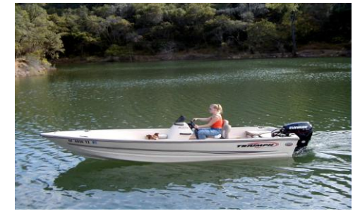
U2 5 PEOPLE MAX $100/day 17' single console, 50 HP motor

***All prices are subject to change. For verification of current prices and availability, call 530-432-6302 Boats are reserved by payment of ½ rental fee in advance.