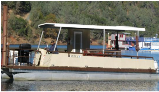
B LITE 12 PEOPLE MAX

10x30 Sun shade, sink, cook top, gas BBQ, table & chairs, flush toilet, 40HP motor $200/day