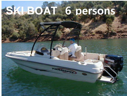
SKI BOAT 6 persons

$300/day $300 CASH Deposit $25 Ski Package $50 Tube Package