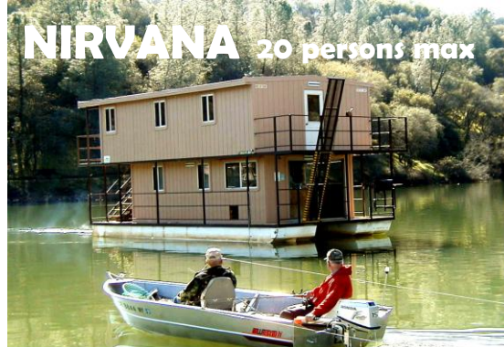
NIRVANA 20 persons max

$1000/weekend ($ 275 for extra day) $1400/Mon-Fri $2000/week