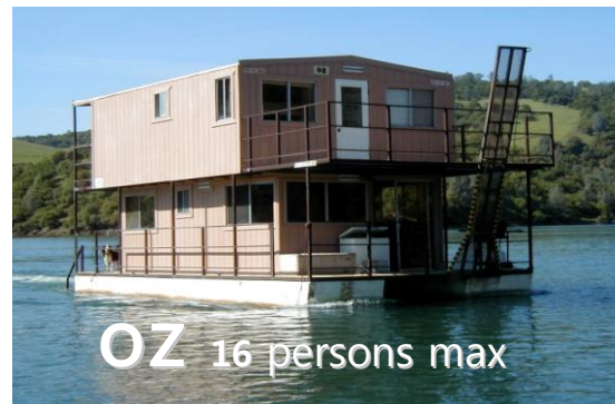
OZ 16 persons max

16X32 (1024 sq ft) UPSTAIRS: 3 bedrooms with double bunks, full bath, sun & shade decks. DOWNSTAIRS: 1/2 bath, stove, fridge, gas BBQ, microwave, ice chest, 2 picnic tables, stereo, generator.