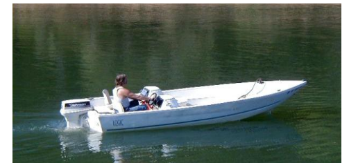
UTILITY 6 PEOPLE MAX $80/day

17' dual console seats, open bow, windshields, 60 HP motor