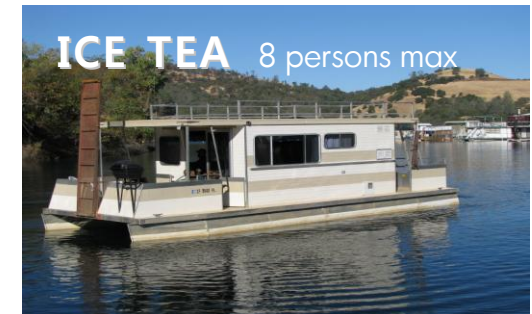
ICE TEA 8 persons max

$1500/weekend ($ 375 for extra day) $2200/Mon-Fri $2800/week