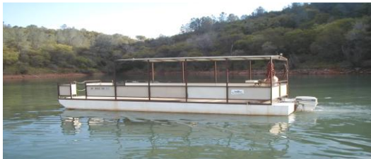
JUNIOR 10 PEOPLE MAX

8x16 Sun shade, side & back benches, 20HP motor $80/day $500/wk