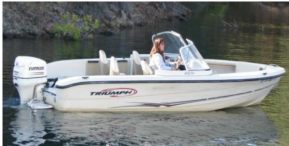
CRUZ SKI 7 PEOPLE MAX $300/day 19' Triumph, 115 HP motor

$300/day $300 CASH Deposit $25 Ski Package $50 Tube Package