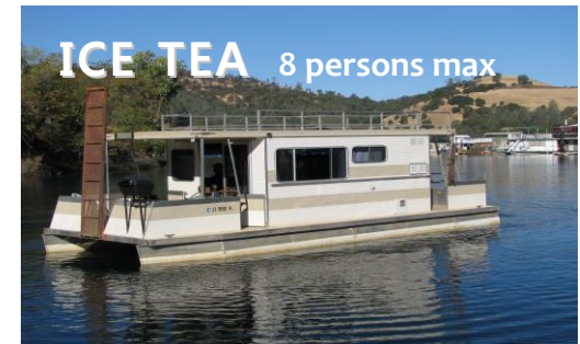
ICE TEA 8 persons max

18x44 (1584 sq ft) Large floating vacation home. UPSTAIRS: 3 bedrooms with double bunks, 2 queen bedrooms, 4 portable sleeping pads, full bath, sun & shade decks. DOWNSTAIRS: ½ bath, stove, refrigerator, gas BBQ, microwave, ice chests, tables/chairs, 2 sofa beds, stereo, DVD, generator $1500/weekend $2200/Mon-Fri $2800/week