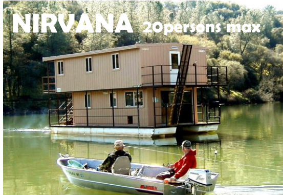
NIRVANA 20 persons max

16X32 (1024 sq ft) UPSTAIRS: 3 bedrooms with double bunks, full bath, sun & shade decks. DOWNSTAIRS: ½ bath, stove, fridge, gas BBQ, microwave, ice chest, 2 picnic tables, stereo, generator. $1000/weekend $1400/Mon-Fri $2000/week