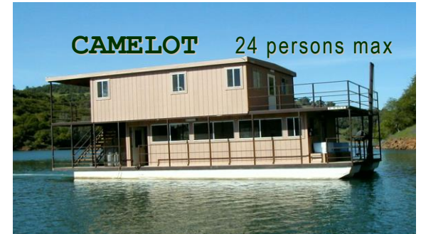
CAMELOT 24 persons max

18x44 (1584 sq ft) Large floating vacation home. UPSTAIRS: 3 bedrooms with double bunks, 2 queen bedrooms, 4 portable sleeping pads, full bath, sun & shade decks. DOWNSTAIRS: ½ bath, stove, refrigerator, gas BBQ, microwave, ice chests, tables/chairs, 2 sofa beds, stereo, DVD, generator $1500/weekend $2200/Mon-Fri $2800/week