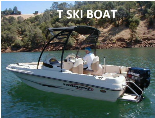
T SKI BOAT