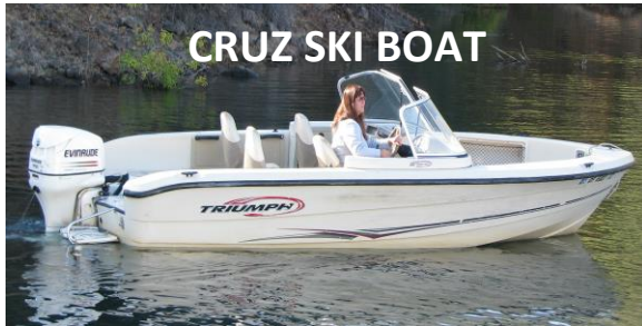
CRUZ SKI BOAT

CRUZ SKI – Now has Tower 7 PEOPLE MAX $300/day 19' Triumph