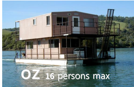
OZ 16 persons max

CRUZ SKI – Now has Tower 7 PEOPLE MAX $300/day 19' Triumph